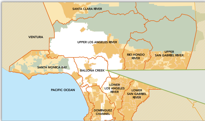
There are nine watersheds in the Los Angeles County Flood Control District in which the proposed clean water fee would be collected annually.

The proposed clean water fee would provide dedicated funding for local and regional projects and programs to help keep pollution out of stormwater and runoff, clean up pollution that flows into our waterways, and use stormwater and runoff to recharge groundwater supplies, which are an important source of drinking water. The fee could also be combined with other funding such as state and federal grants for multibenefit projects that improve water quality and provide other public benefits as well.